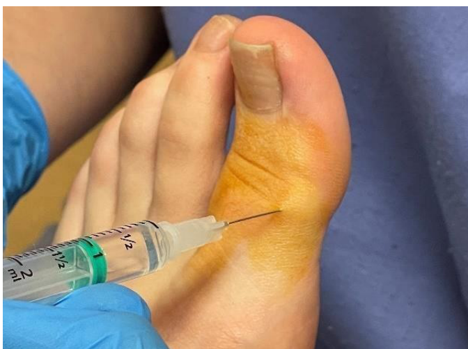
Figure 2. Frost H anesthetic.

tion and infiltration are performed. The needle is then withdrawn to the more superficial level, where a second aspiration and infiltration are performed.