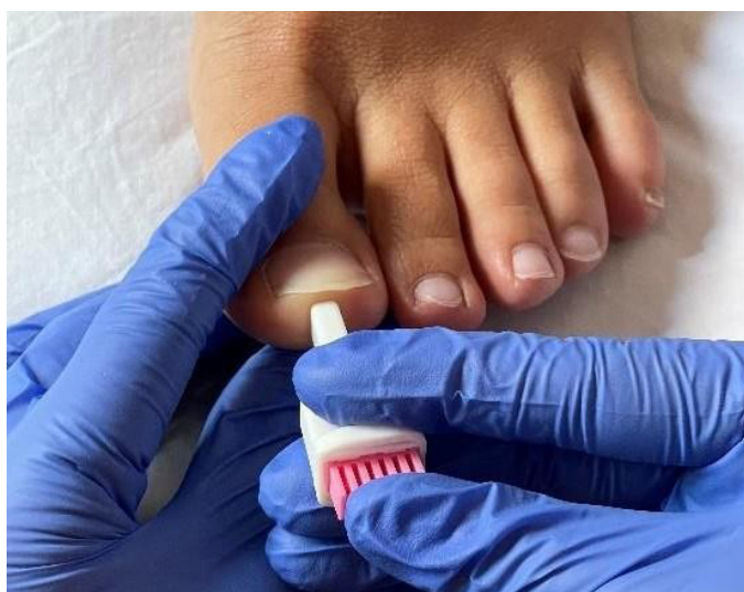
Figura 4. Posterior lancet puncture 29 G.

In the overall group, the mean pain in women was 4.3 + 1.5, while in men it was 3.4 + 1.7, with no significant difference between the