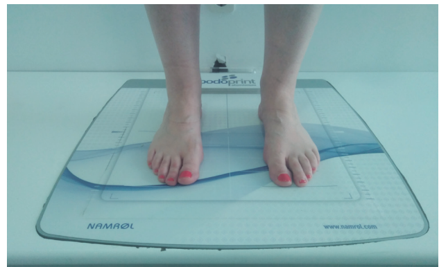
Figure 2. Measurement took with the subject in position 1.