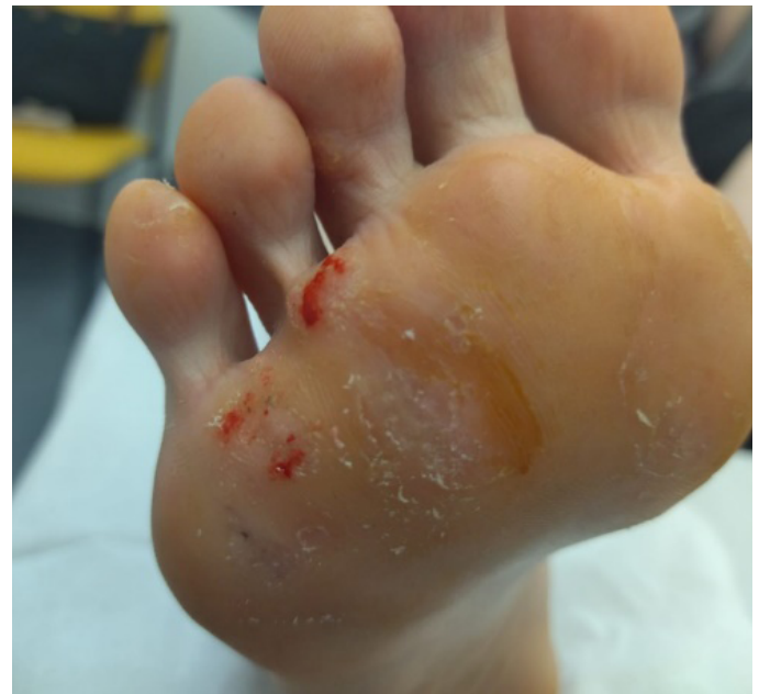
Figure 3. 1 week after starting treatment.

The PCR result came out POSITIVE for HPV for 2 different biotypes, 2 and 27, two of the most frequently isolated biotypes in plantar warts, and biotype 27 has been associated in former studies with recalcitrant plantar warts 4,12 . After having undergone multiple previous treatments without good results, treatment with Imiquimod (Inmunocare®) 50 mg/g cream was proposed. This treatment, as previously mentioned, is authorized by the AEMPS for the treatment of anogenital warts but is not indicated in its technical sheet for the