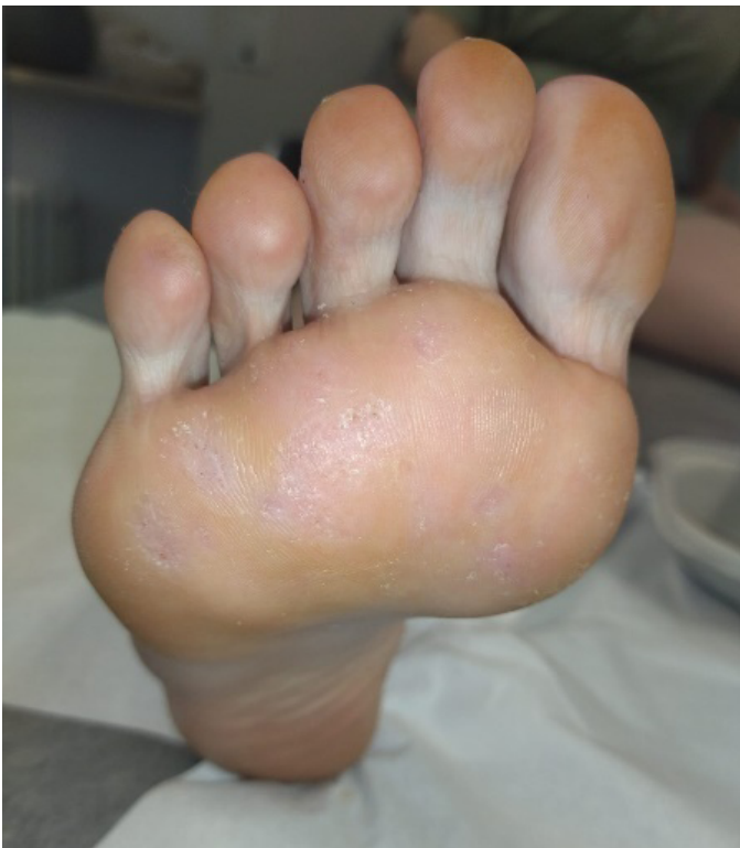
Figure 4. 3 weeks after starting treatment.