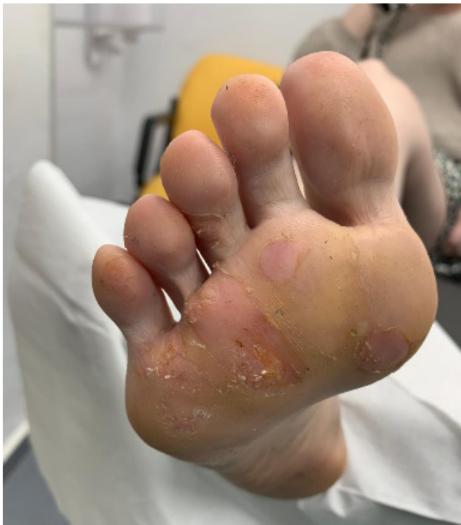
Figure 1. First consultation.

Germisidin® as an antiseptic gel was prescribed to control microbial flora and sweating until the results were delivered, scheduled for 2 weeks later.