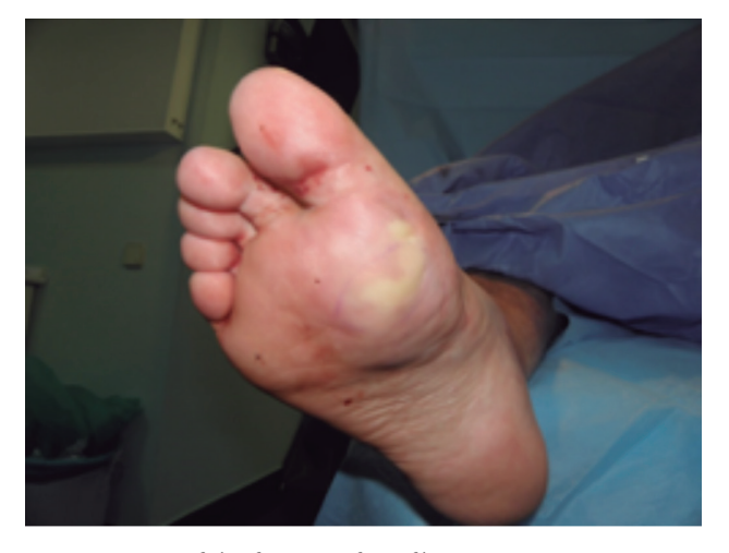
Figure 7. View of the foot post fat infiltration.