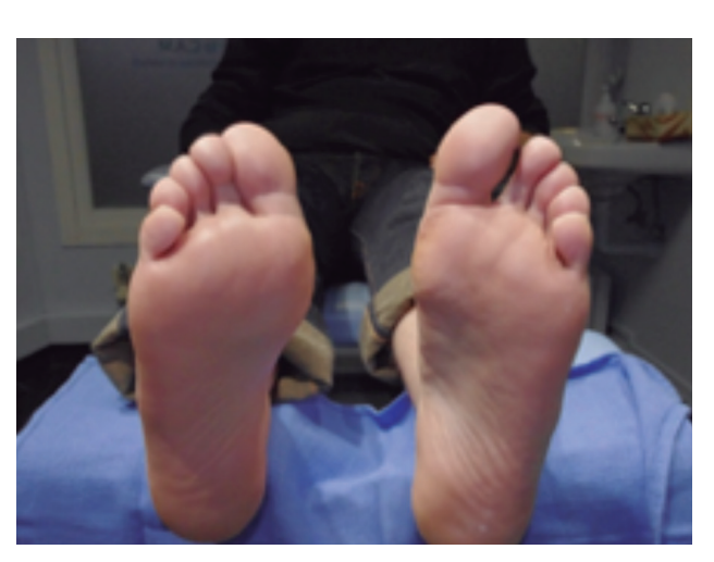
Figure 8. View of both feet 2 years post fat infiltration.