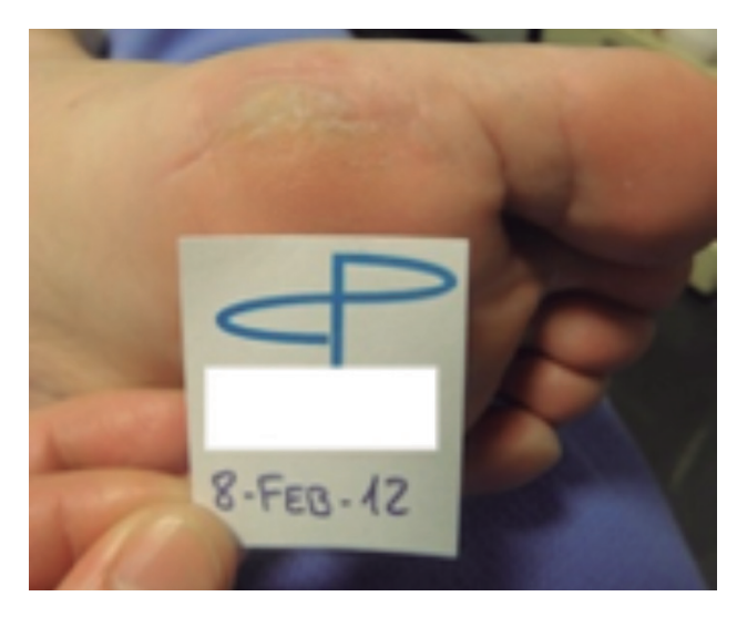
Figure 1. Preop view of the left foot.

In the exploration, the patient refers pain at direct touch of the sesamoidal area of both feet, more intensely in the right one. It also presents surgical scars, plantar-medial located in reference to the first metatarsal of both feet which corresponds to the surgical approaching ways, with the specific characteristic that the one in the left foot is adhered to deeper structures. It also presents loss of the plantar fat pad under the sesamoidal area of both feet, consequence of the previous surgeries, with plantar-medial hyperqerathosis in both feet, constant pain in static and an avoiding-pain walking in supination, which causes dynamic varization of the forefoot. It also begins a Morton neuralgia due to all this (Figure 1).