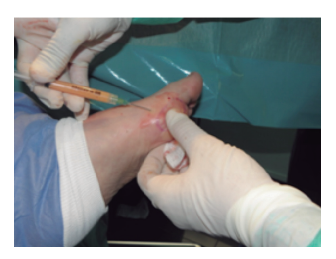
Figure 6. Aplication of fat in second surgery.

According to the patient, we decided to not realize by the moment any other injection and evaluate year by year the evolution and integration of the self-fat injected graft (Table I).