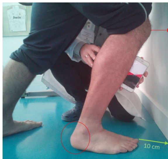
Figure 1 Weight-bearing Lunge test.

Demographic data from the subjects included in the study was registered, including sex, age, height, weight and Body Mass Index (BMI). In addition, Foot Posture Index (FPI) was registered following the protocol established by Redmond. 23 In order to be eligible for the study, subjects had to meet the following inclusion criteria: at least 18 years of age and not older than 50 years old, signed written informed consent and a normal BMI. None of the enrolled subjects was undergoing rehabilitation treatment at the moment of the study or underwent lower limb surgery. Patients who, at the start of the treatment, did not meet any of the inclusion criteria were not eligible for the study. Patients were admitted to the study in order of arrival to the podiatry clinic and then classified into the cases group, if HLF, and into the control group if the subject did not present with a HLF.