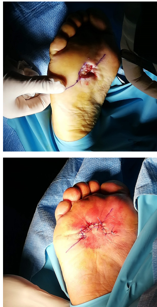
Figure 2. Intraoperative images.

a hydrocolloid dressing, and a protective bandage. Suture removal was performed on day 15, and the use of a rigid Darco-type offloading brace was prescribed for 30 days to facilitate complete healing of the area. After brace removal, the use of padded orthopedic footwear was recommended to minimize pressure on the operated area and promote skin integrity.